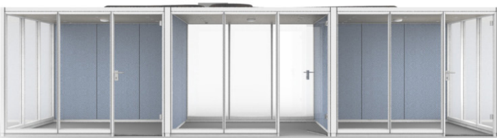
Air Conditioning used in a triple pod

Pod air is passed through the evaporator section, where it is cooled and recycled on a continuous loop from pod to machine and controlled by a thermostatic set-point. Rejected heat is passed through the condenser section of the refrigeration system, where the heat absorbed from the pod is rejected to external atmosphere.