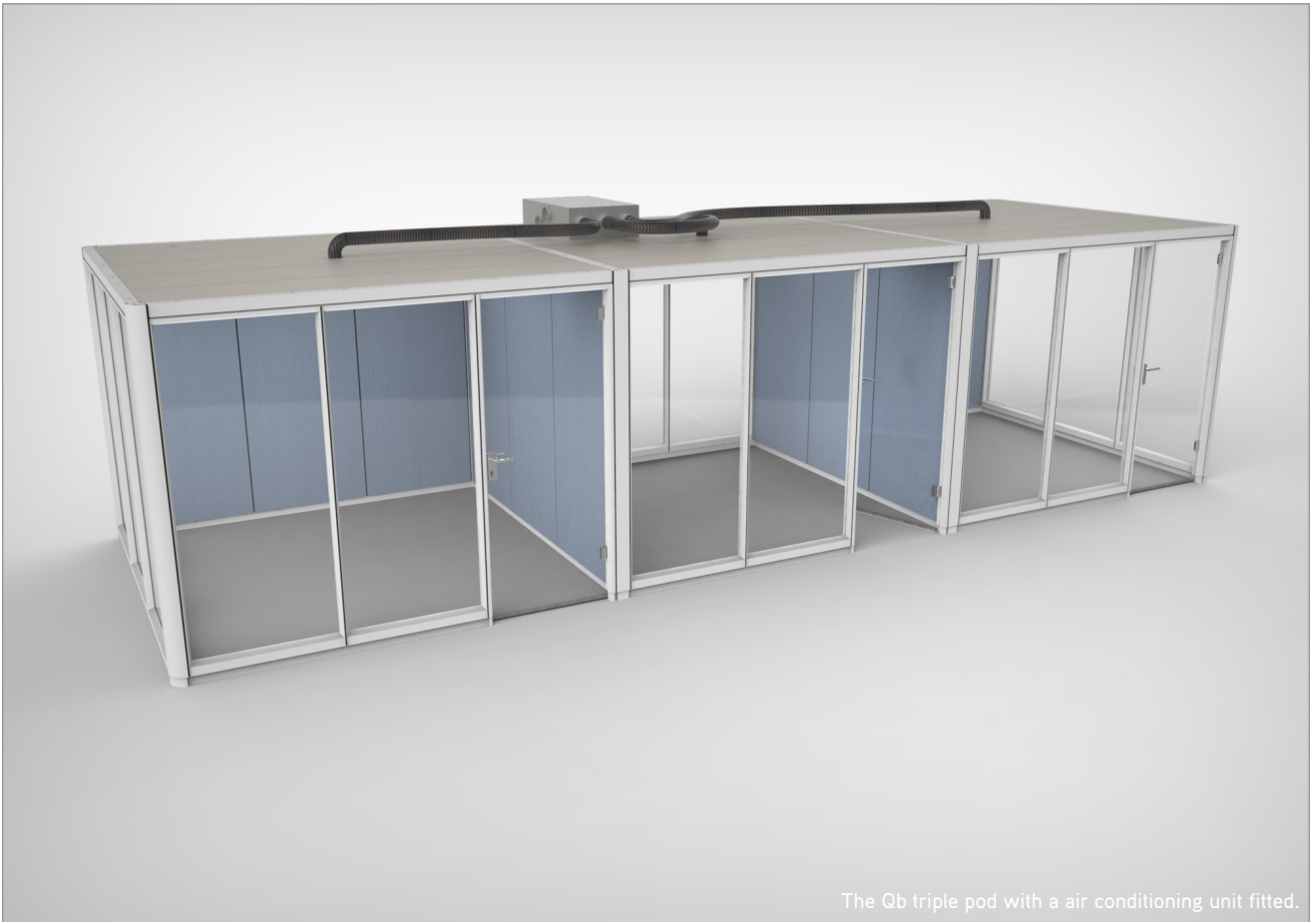
The Qb triple pod with a air conditioning unit fitted.