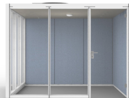
Air Conditioning used in a single pod